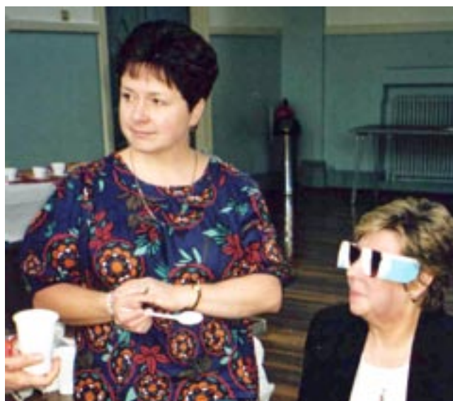
Figure 3 Care-Home Staff Training Programme: Role play facilitation aides