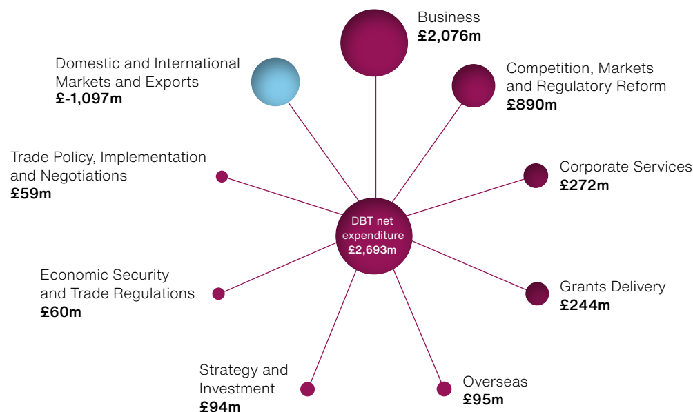
Department for Business and Trade (DBT) areas of spending for 2023-24 (Net Expenditure, £ million)

DBT employed an average of 10,268 full-time equivalent (FTE) staff during the 2023-24 financial year. The total includes 7,991 FTE permanently employed staff in the UK and 1,609 FTE working in DBT's overseas network. 2 DBT has a network of trade commissioners and trade teams located around the world.